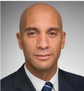
Adrian Fenty Honorary Co-Chair